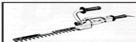
1957 - PORTABLE ELECTRIC HEDGE TRIMMER