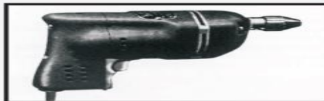
1946 - World's 1st Consumer Drill