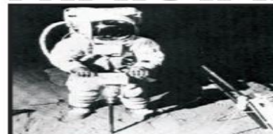
1969 First drill on the moon

As a market driven company, Black & Decker is committed to building strong partnerships through end-user focus, customer satisfaction and continuous system enhancement to bring to the consumer the latest products of the highest quality. Black & Decker re-affirms its commitment through a full two-year warranty across all home products. A wide network of well-equipped and trained service centres backs this unique warranty across the world.