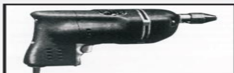
1946 - World's 1st Consumer Drill