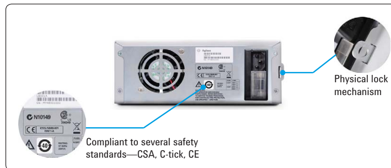
Figure 3. Safety and security features of the U8000 Series single output DC power supplies