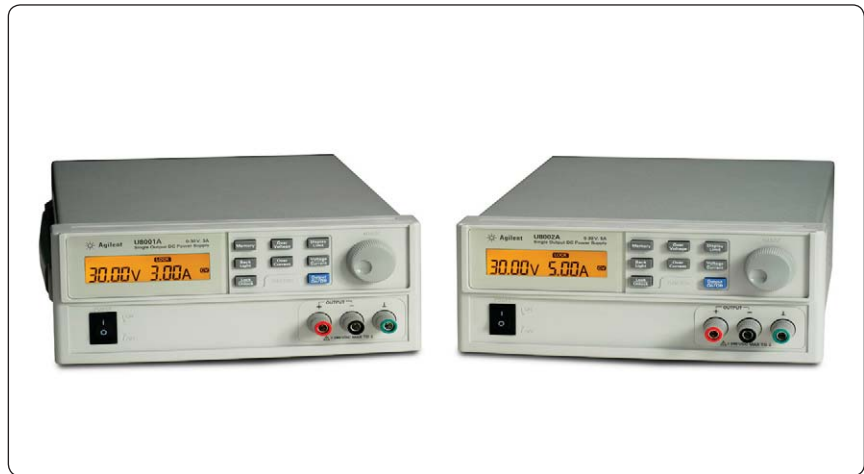
Figure 1. The U8001A 90 W and U8002A 150 W single output DC power supplies