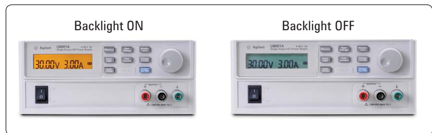
Figure 2. Backlight on/off options for LCD display